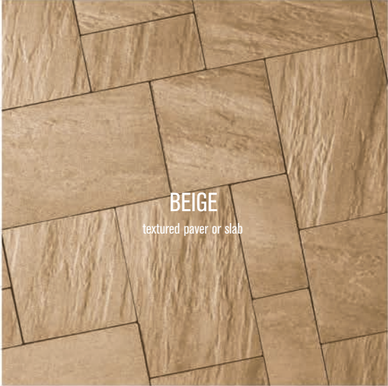
BEIGE textured paver or slab