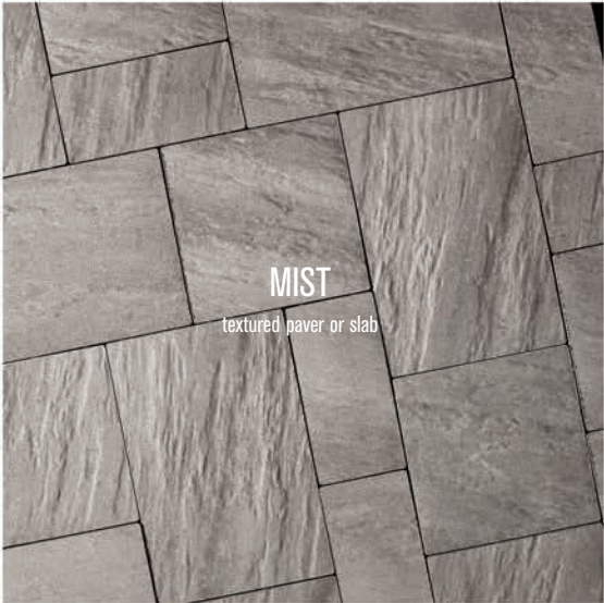
MIST textured paver or slab