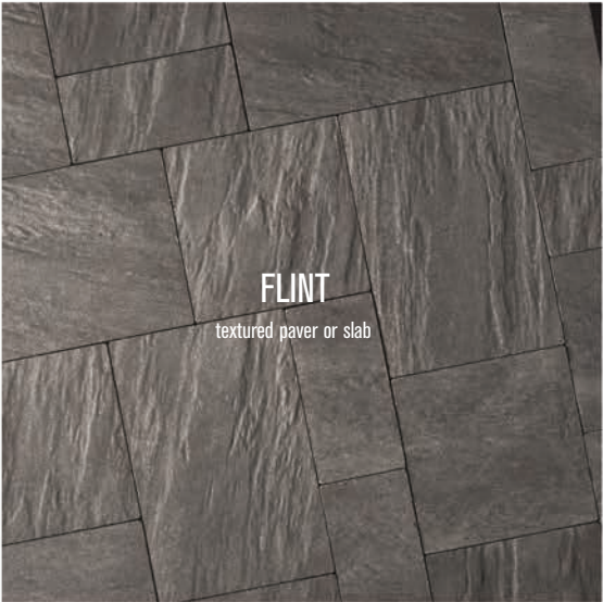
FLINT textured paver or slab